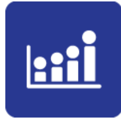
Growth & Employment