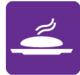
Food Security & Nutrition